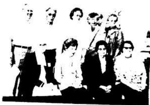
8506001-04A Cook descendants; Terrell Reunion; Athens, TX; 06/01/1985